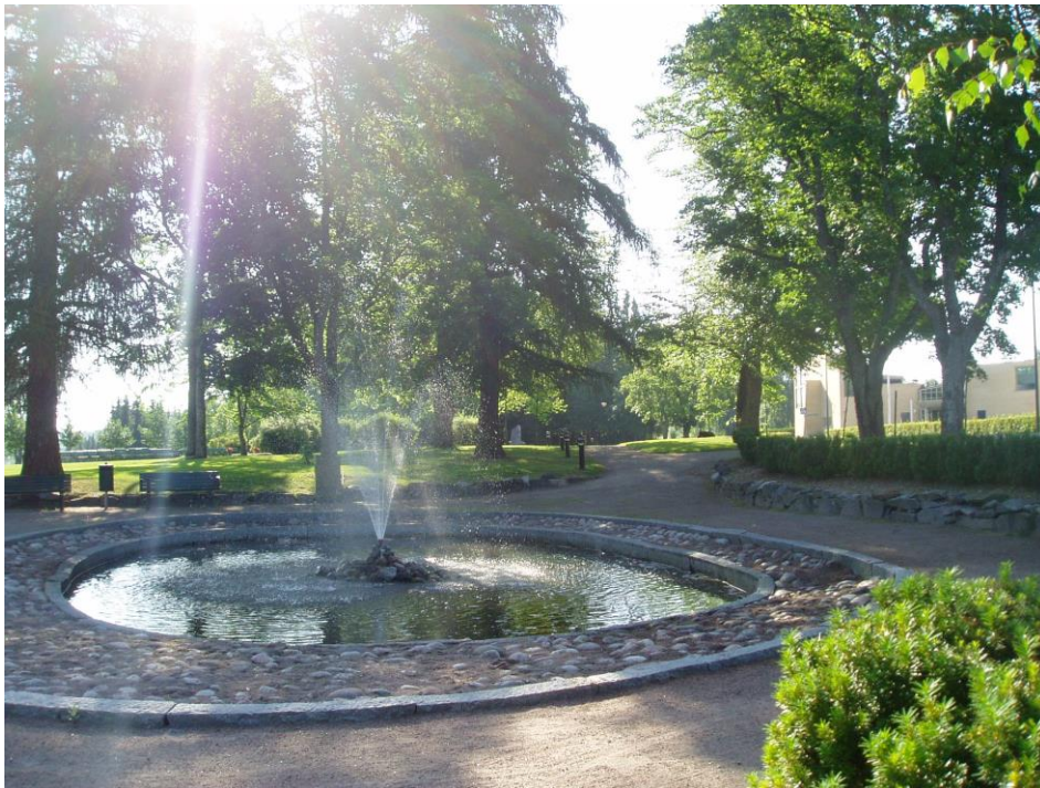
up: Paimio's Church left: Park in the Paimio center