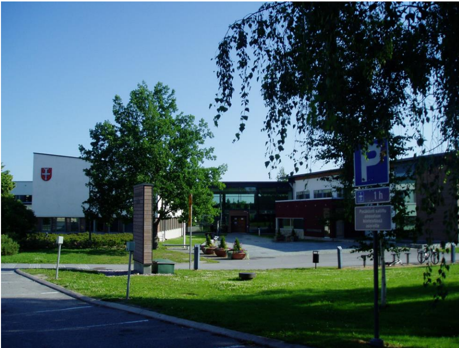
Paimio library and town hall