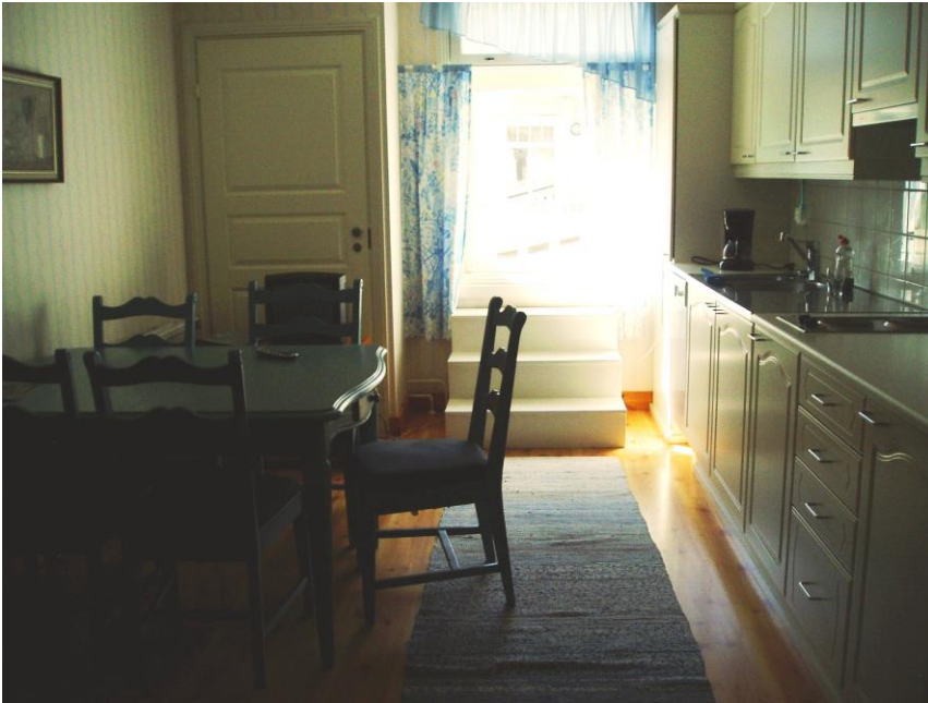
A kitchen in Päätälo